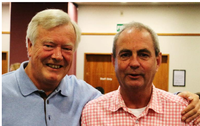
Alan Dormer - Anthony Hopkins