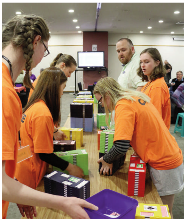
Some of our Hard-working Caddies