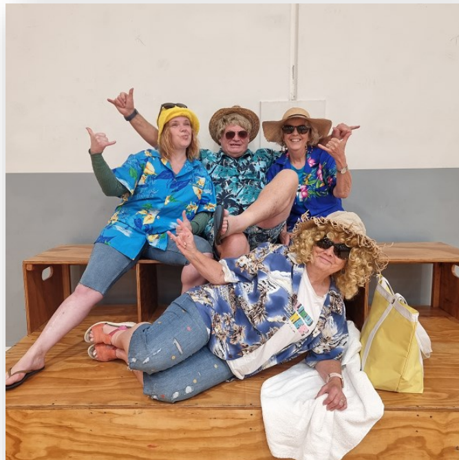
Officially the Beach Bums - from Wanaka????