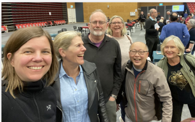
The Mt Albert crew